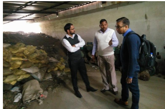
Pic: CETP Sludge storage in Lawrence Road CETP- Visit by SINTEF consultant