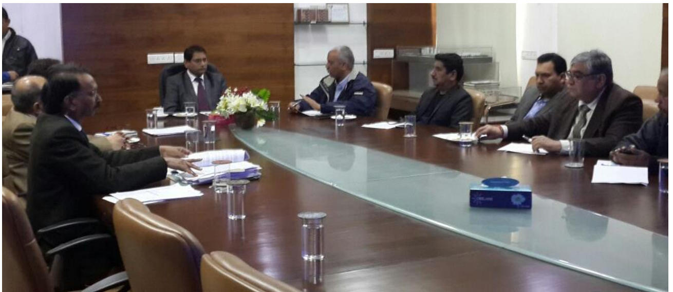
Pic: Meeting with CMD, DSIIDC with all stakeholders on 6th February at DSIIDC, CP office.