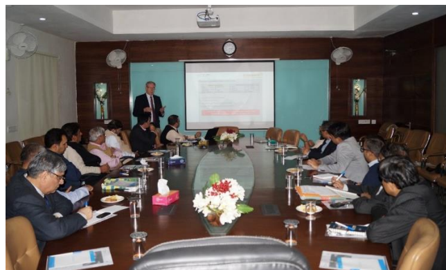
Pic: Workshop on management structure on 16 th February at DSIIDC, CP Office.