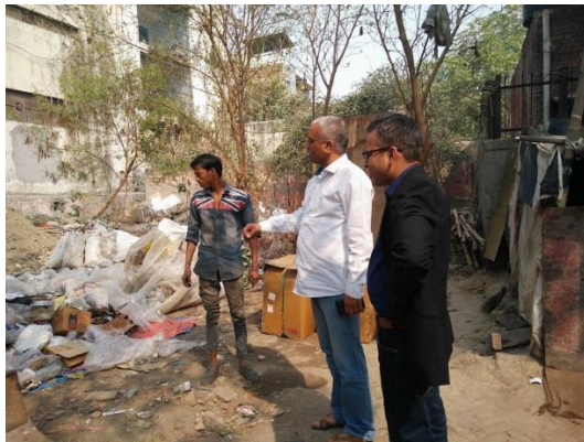
Pic: Solid waste collection point in an open plot near PFEA office for segregation- Visit by SINTEF consultant